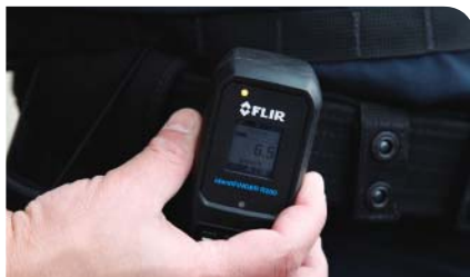
Belt-wearable for easy access