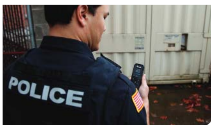
Easy-to-read interface for quick threat detection